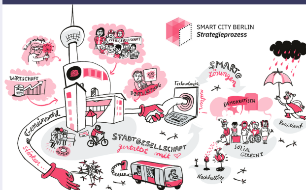
Graphic: 123 comics, 2021